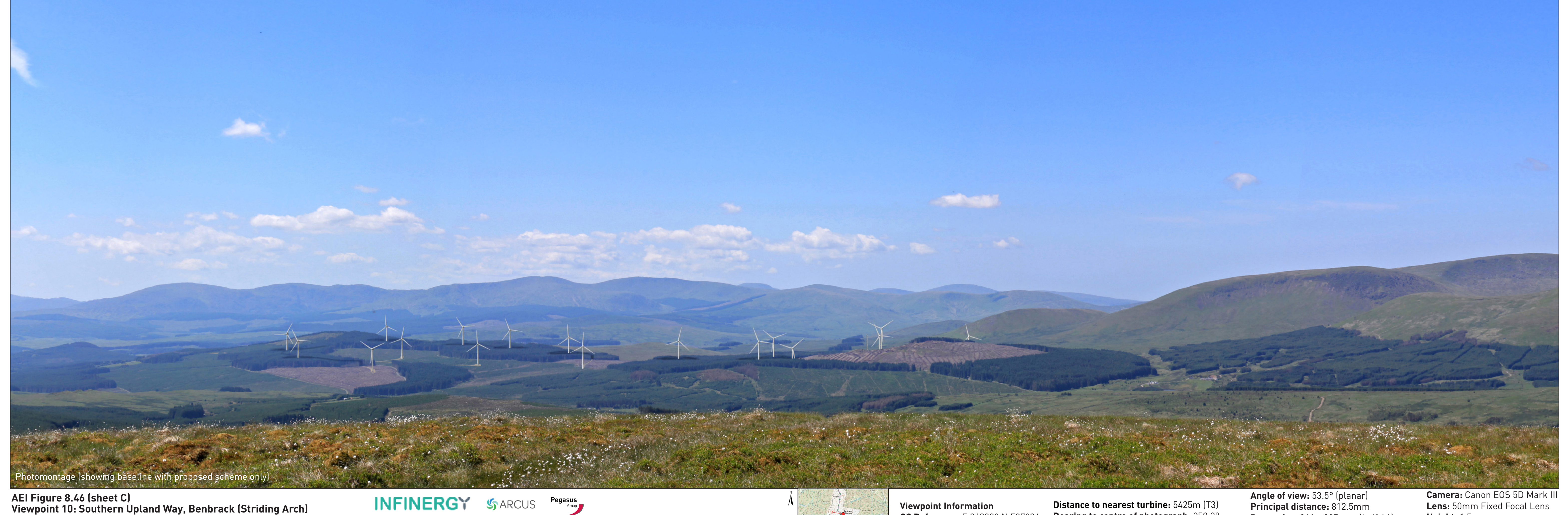
AEI Figure 8.46 (sheet C) Viewpoint 10: Southern Upland Way, Benbrack (Striding Arch) SHEPHERD'S RIG WIND FARM